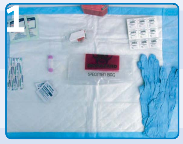
Place all collection materials on top of disposable pad. Open the lancet, alcohol swabs, gauze, bandage, and other items. Have all items ready for blood collection.