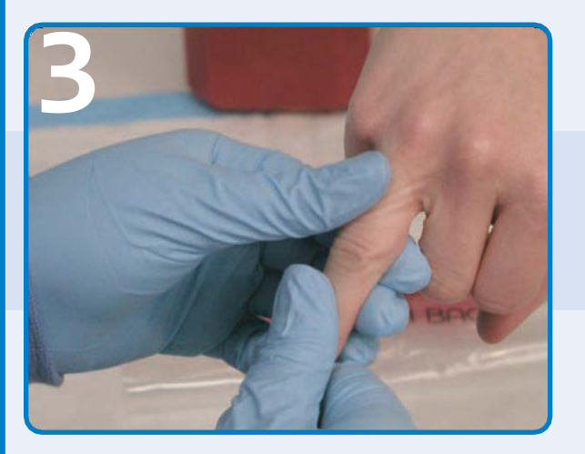
Massage the patient's hand and lower part of the finger to increase blood flow. Turn the hand down.