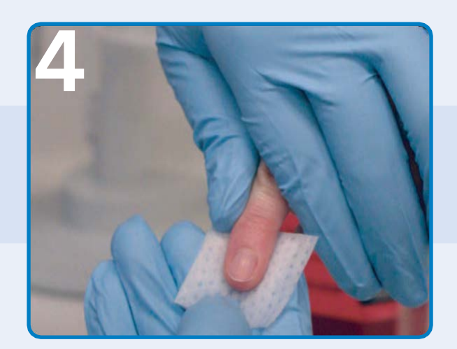
Scrub the patient's middle finger or ring finger with an alcohol swab.