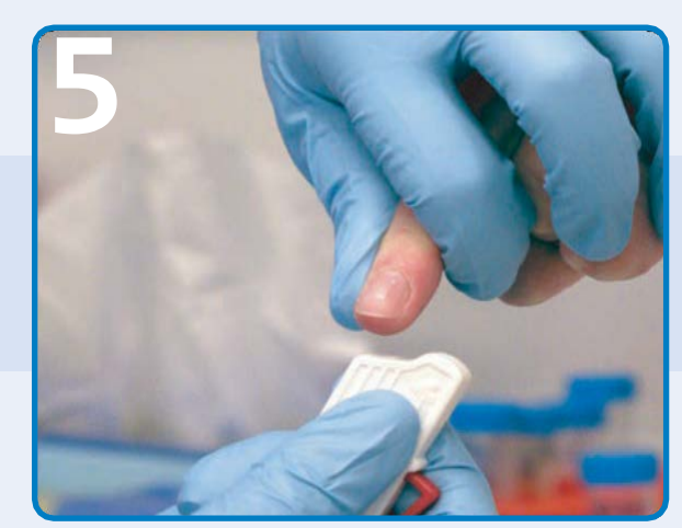
Hold the finger in a downward position and lance the palm side surface of the finger.