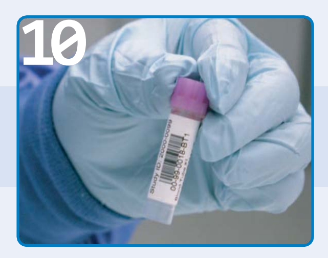
Place the label on the vial. If the label contains a barcode, the barcode needs to be vertical like a ladder when placed on the vial. If the barcode is not vertical, the laboratory will not be able to read the label. Properly discard all used materials. Contact the laboratory for storage and transport guidance.